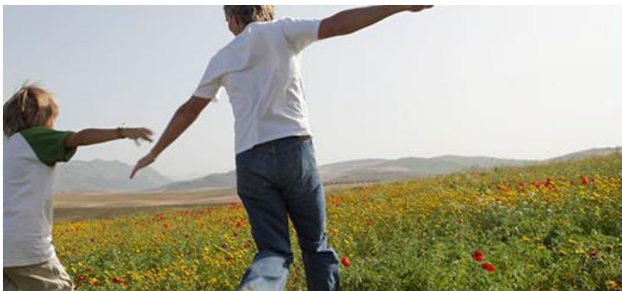
Real Estate, Pharmaceutical, Healthy Cereals. Nope! This is directly from a website for a Law Firm.

Let's look at some examples of websites that have used stock photography and compare to others that utilize custom photography. Can you identify the business that the photograph below is related to?