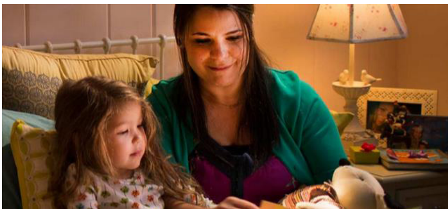
Tutoring services, Family Psychology, Head-Start Program. Sorry, this is from a (BIG) investment company.

Let's try to match a company to the image below taken directly from a prominent website.